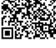
QR Code to the policy inventory

www.vuau.qualtrics.com/jfe/form/SV_8wu7si78YfaeXbB